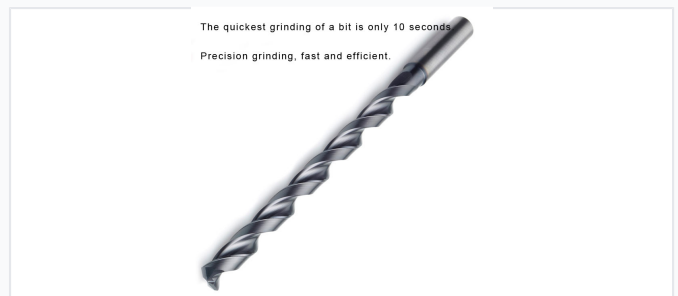
High efficiency operation: complete a standard re-sharpening in as little as 10 seconds.