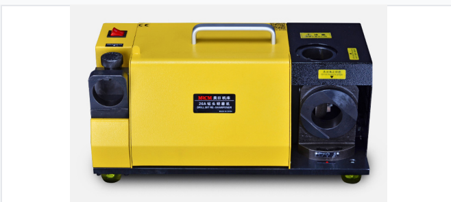
Precision grinding interface ensuring accurate point angles for every drill bit.