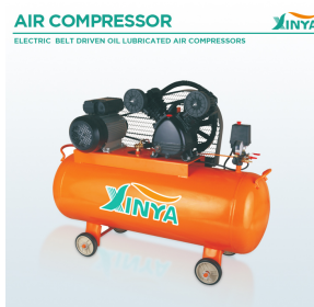
Portable electric belt-driven air compressor with 100L tank.