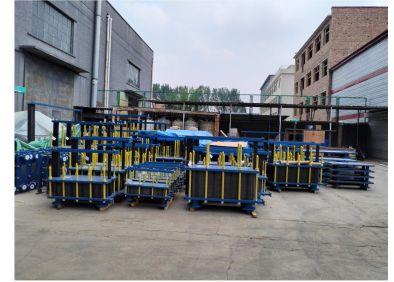
Plate heat exchangers are widely used for efficient heat transfer between fluids. Their applications span across HVAC, petrochemical, water treatment, and various other industries.