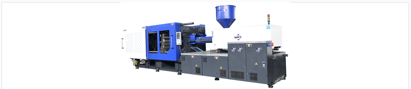
Overview of the NPC 500 plastic injection molding machine.