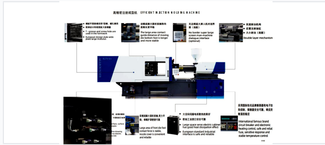
Detailed view of the European-style formwork design, featuring T-groove and screw hole compatibility for versatile mold mounting.