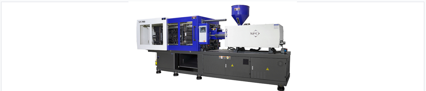
The NPC 900 plastic injection molding machine featuring a robust clamping unit and energy-saving hydraulic system.