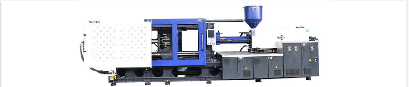
High-performance plastic injection molding machine featuring a robust clamping unit and advanced control interface.