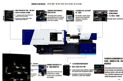
European-style design featuring a large-screen interface and stable, high-precision injection unit.