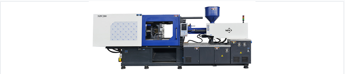
The NPC 280 plastic injection molding machine featuring a robust clamping unit and injection system.