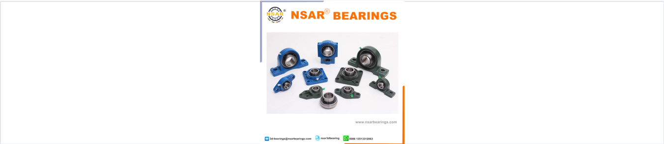
Standard pillow block bearing unit featuring a robust housing designed for industrial shaft support.

Reliable Shaft Support Pillow block ball bearings are essential mounted bearing units designed to provide robust support for rotating shafts in various industrial environments. These units consist of a durable housing, typically constructed from cast iron or pressed steel, which contains a precision ball bearing insert. Engineered for ease of installation and maintenance, these bearings are an ideal solution for applications such as conveyors, fans, and agricultural machinery, ensuring smooth operation and longevity.