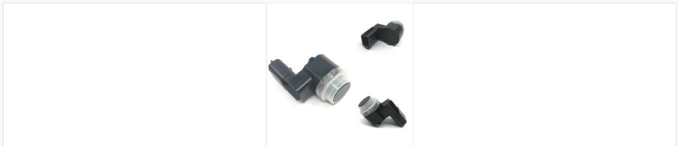
Ultrasonic parking assist sensor designed for reliable obstacle detection.