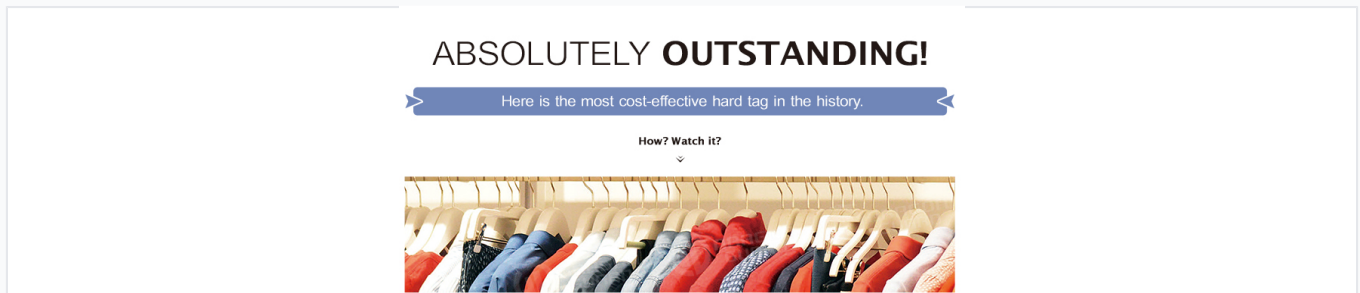
A cost-effective hard tag solution for long-term retail security.