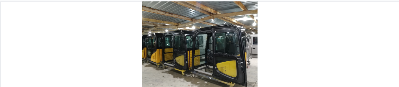
A variety of operator cabins designed for construction, mining, and industrial machinery.