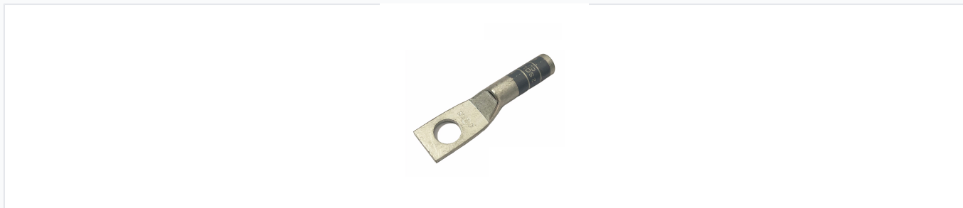
Standard barrel copper lug with inspection window for verifying wire insertion.