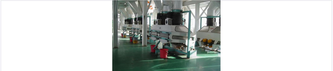
Primary cleaning and sorting stage equipment.