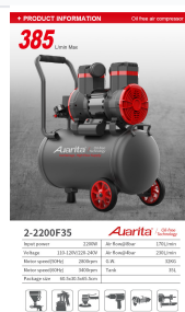
Performance overview and technical specifications for the 2200W oil-free air compressor.