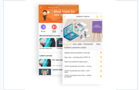
Internal staff training platform supporting diverse multimedia course content.