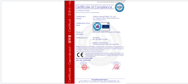
Official documentation confirming adherence to EN 149:2001+A1:2009 standards.