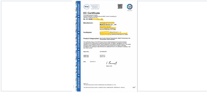
Official EC Certificate confirming compliance with Directive 93/42/EEC on Medical Devices.