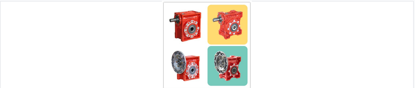
Durable stainless steel housing designed for high-torque industrial applications.