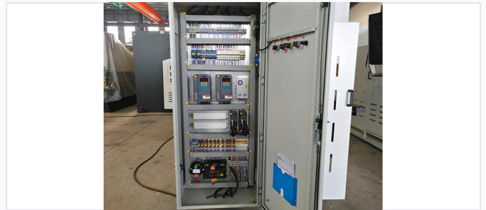
Integrated electrical control cabinet for system management.