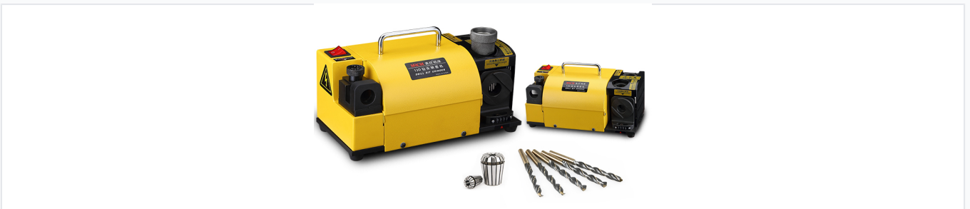
The MR-13D drill bit grinder provides precise and efficient sharpening.