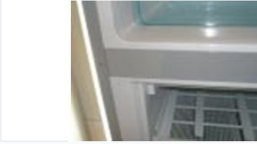
Polyurethane super micro cell-foaming technology ensures superior insulation.