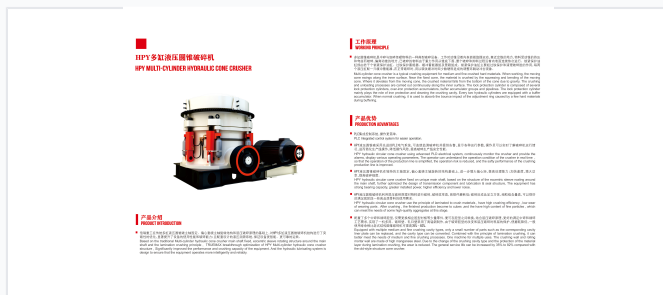
Internal design featuring the main shaft, eccentric sleeve, and lock protection cylinder system.