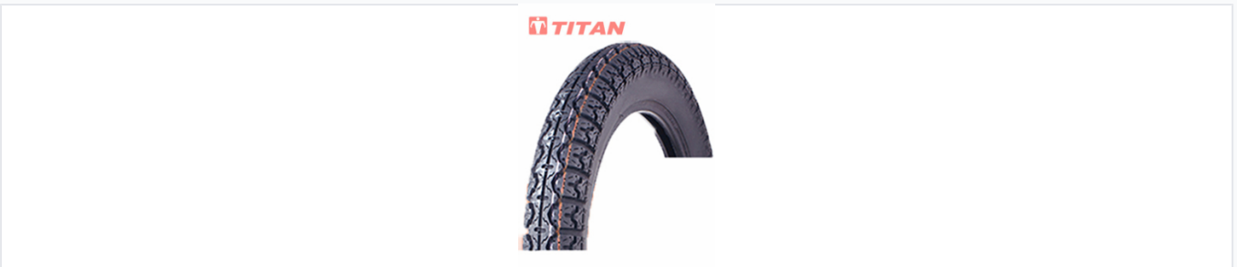
Engineered tread pattern for superior water displacement and stability.