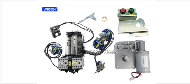
WBS010-C model configuration including motor and control panel.