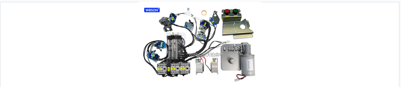
Internal view of the WBS010-F kit, featuring contactors, relays, and pre-wired harness.