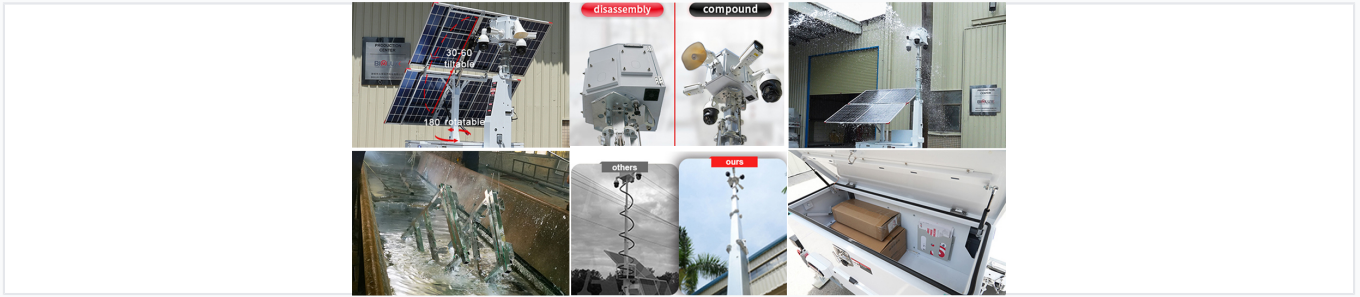
Detailed view of the rotatable solar panels and the surveillance mounting box.