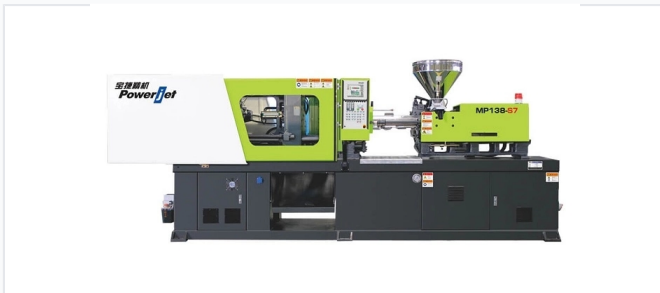
Precision-engineered injection unit for mobile phone accessory production.