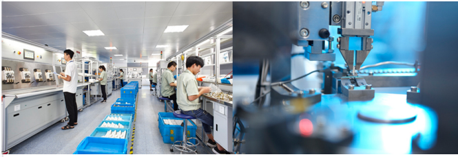
Space-saving frame size 50 design for efficient panel mounting.