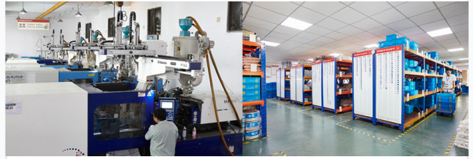
Reliable connection terminals for standard distribution applications.