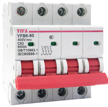
Four-pole configuration with clear terminal markers (1, 3, 5, 7 and 2, 4, 6, 8) and visual status indication.