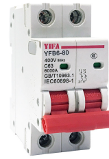
Double pole configuration featuring clear on/off status indication.