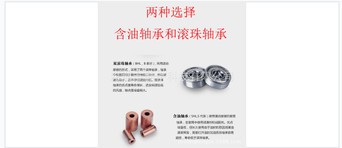
Comparison between long-life double ball bearings and low-noise oil-impregnated sleeve bearings.