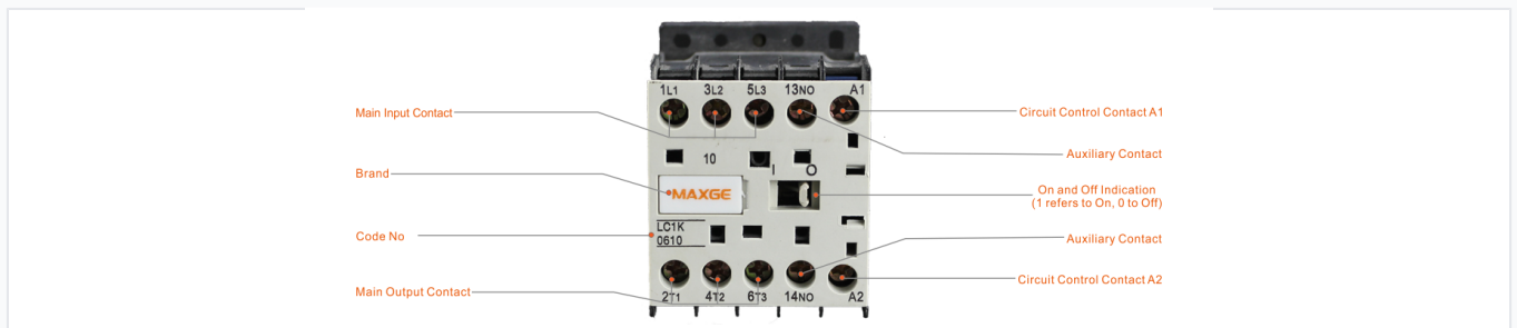
Terminal layout and auxiliary contact identification for easy wiring.