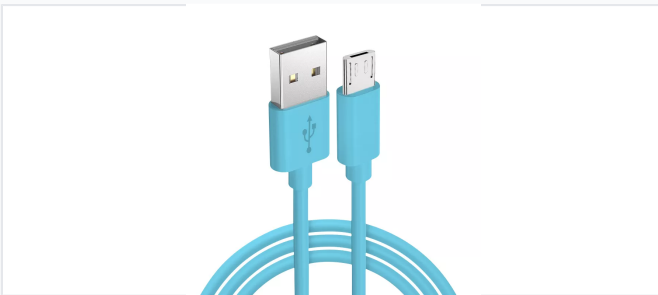
High-speed USB 2.0 A-Male to Micro-B connector design.