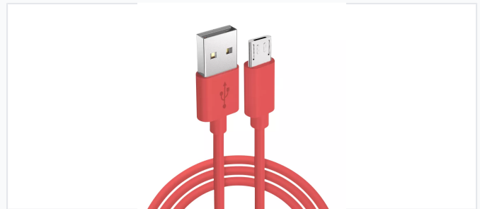
Durable, tangle-resistant round cable construction.