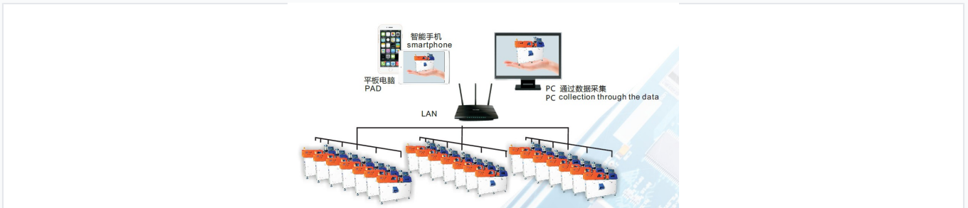
Intelligent connectivity allows for real-time monitoring and data collection via PC, tablet, or smartphone.