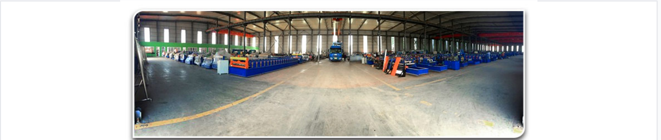
Advanced roll forming technology for consistent profile shaping.