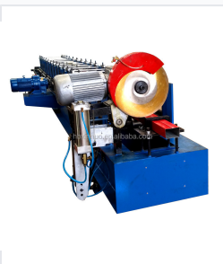
High-grade forming rollers powered by a robust electric motor.