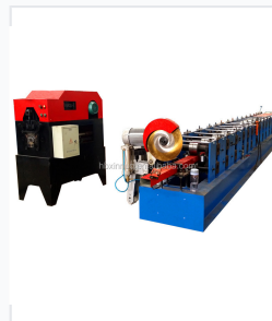
User-friendly control panel for precise adjustment of speed and cut length.