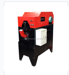
Automated feeding and forming process for high-volume production.