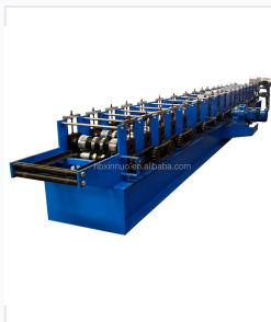
Motorized chain drive system for consistent forming operation.