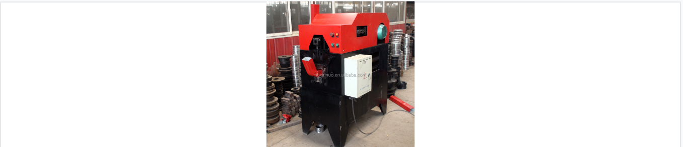
Industrial-grade sheet forming machine featuring integrated control panel and material feed system.