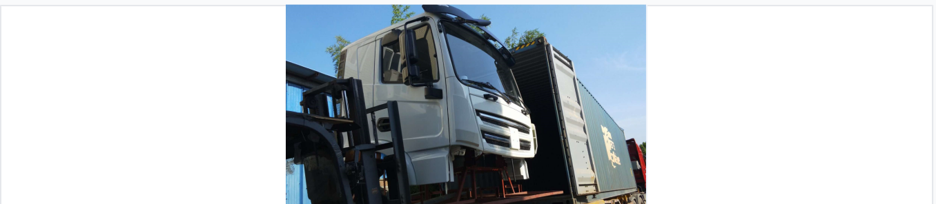
A versatile medium-duty cab featuring a dual-drive system and modern design, ready for chassis integration.