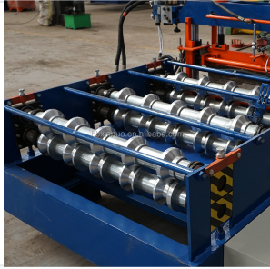
Detailed view of the roller configuration used for precise metal shaping.