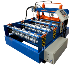
Side profile showing the sturdy construction and roller assembly of the curving machine.