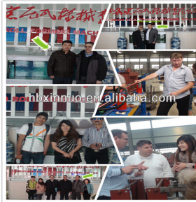
Integrated forming system designed to produce custom tile profiles efficiently.