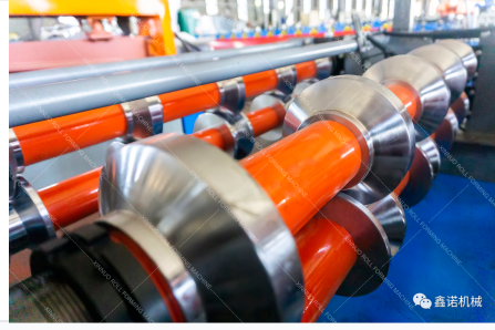
Industrial-grade rollers designed for high-volume production and precision shaping.