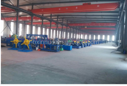
Versatile tile making machinery featuring robust construction for consistent production.