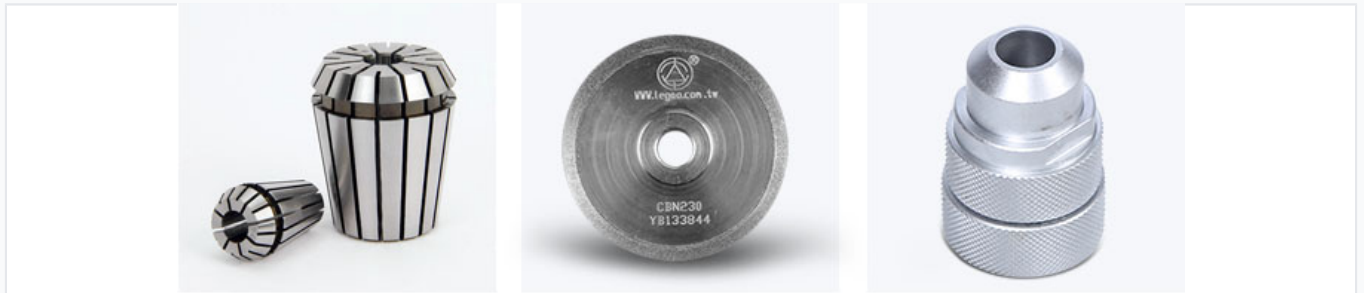
Included precision collets and CBN grinding wheel for HSS materials.