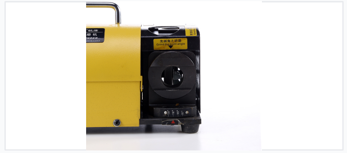
Precision control allows for adjustable grinding angles to suit different bit requirements.