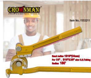
3 IN 1 ALUMINUM TUBE BENDER