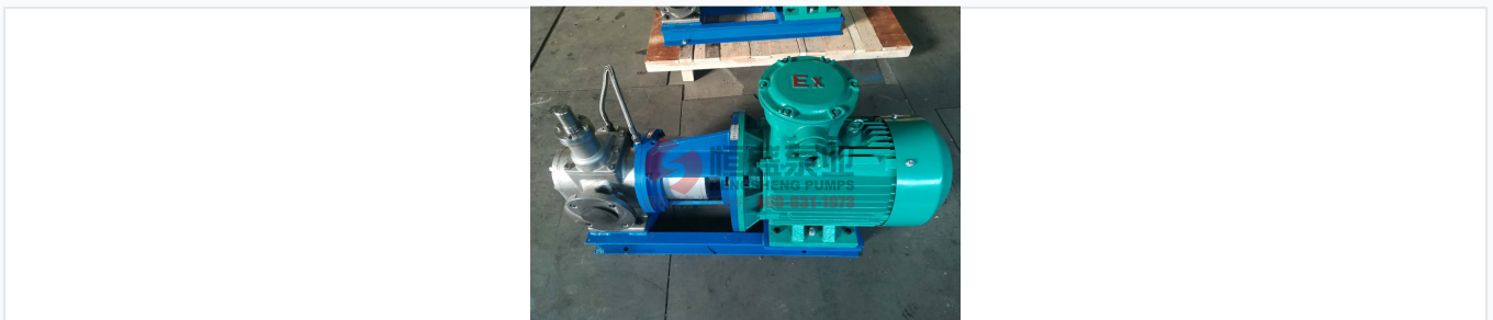
Professional grade pump design featuring integral safety valve and durable construction.