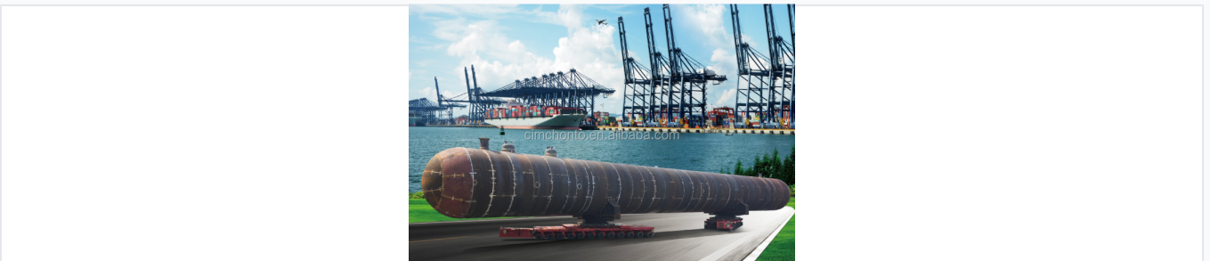
Technical design view of the LPG mounded tank structure.