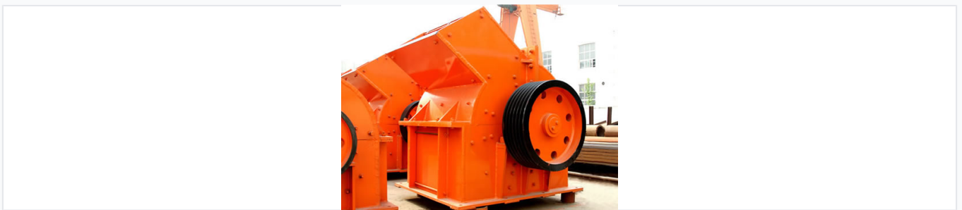
Internal view of the hammer crusher showing the rotor and crushing chamber mechanics.