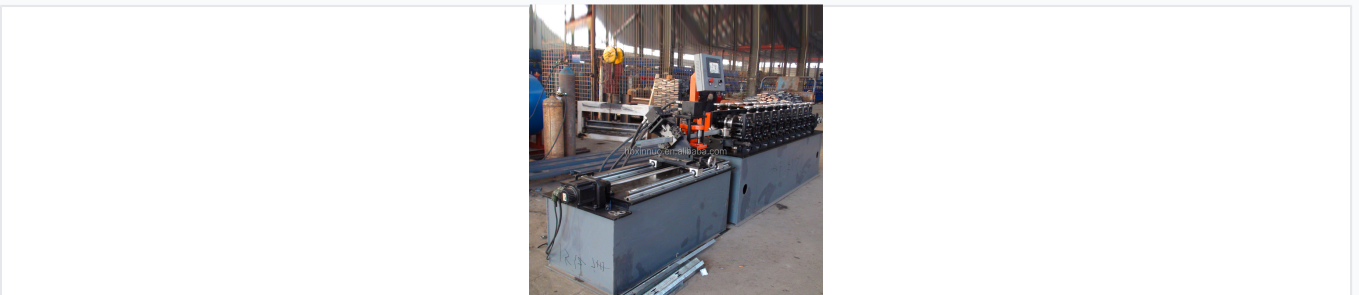
Complete production line setup including uncoiler, leveling device, and forming stations.