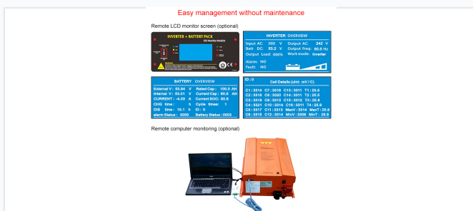
Intelligent monitoring interface showing real-time battery status, voltage, and load parameters.