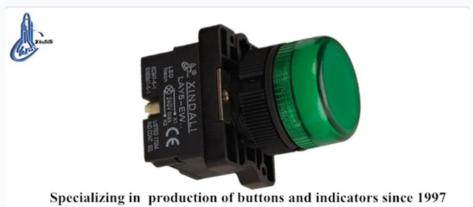
The LAY5-EV63 series push button switch with integrated LED signal light.