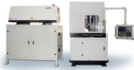
Precision laser welding machine with integrated control cabinet.