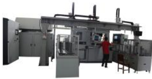
Automated laser welding system designed for high-precision manufacturing.